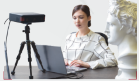
Scanning by geometry