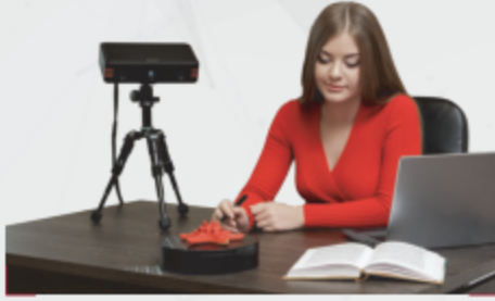
Scanning on a rotary table