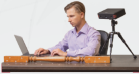
Scanning with markers